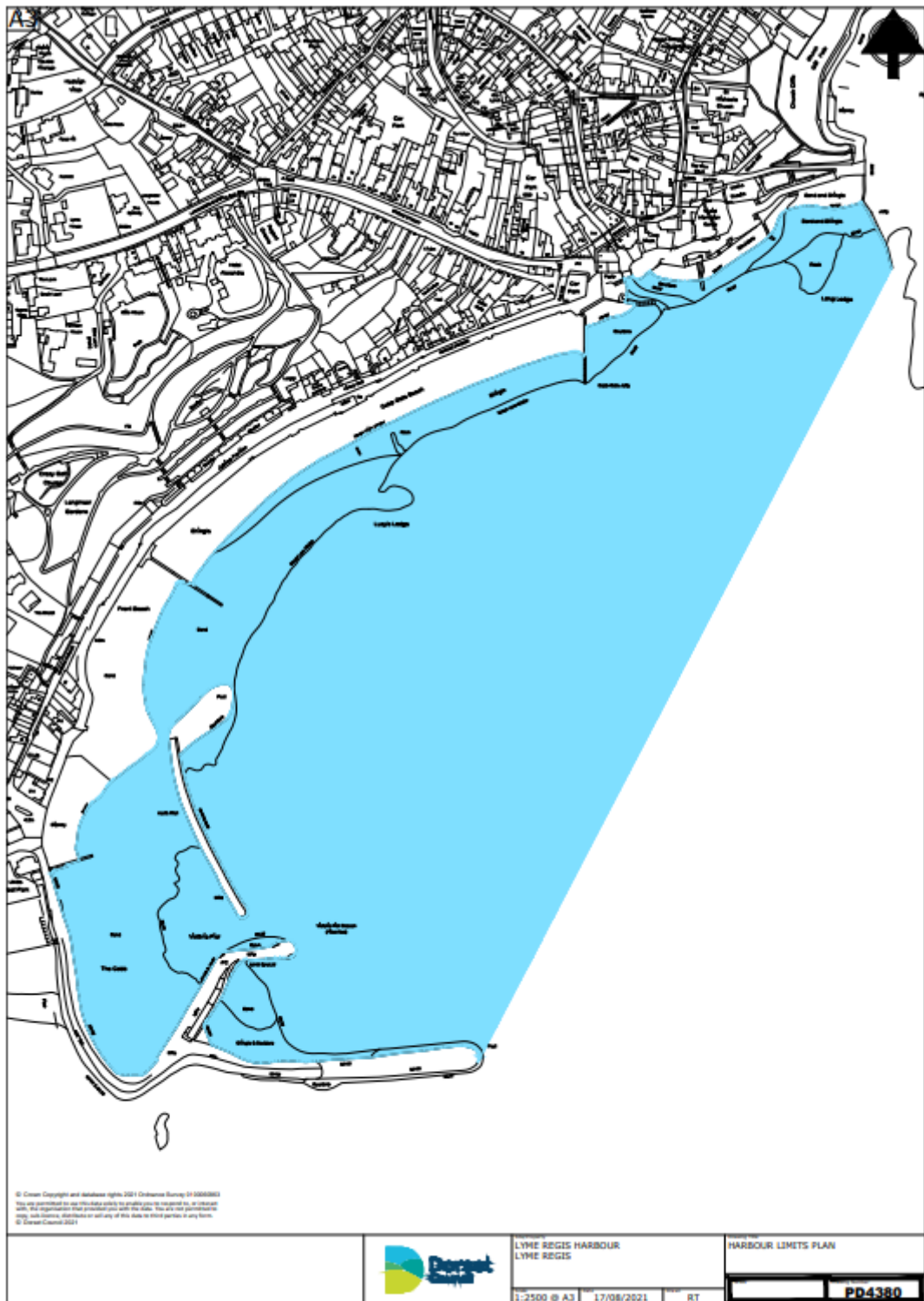
Figure 3: Lyme Regis Harbour Limits