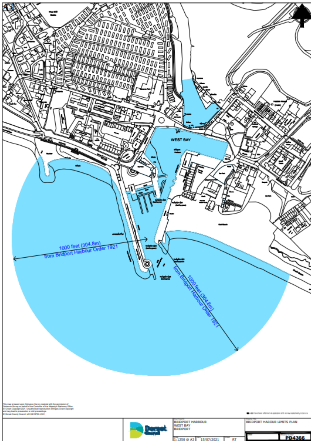
Figure 2: Bridport Harbour Limits